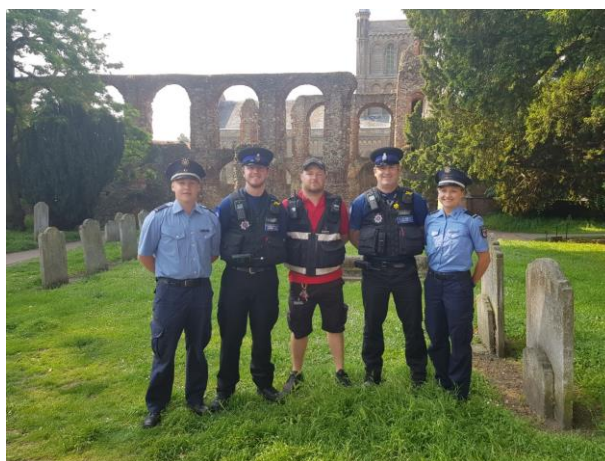
On patrol in Colchester with a local PCSO

Once again IPA UK's Region 10 confirmed their commitment to the International Learning and Development Exchange Programme (ILDEP) with the regular two-week visit from two student police officers from Brandenburg in Germany. German police officers have to spend time with a foreign force in the final part of their training before they can qualify as fully fledged officers.