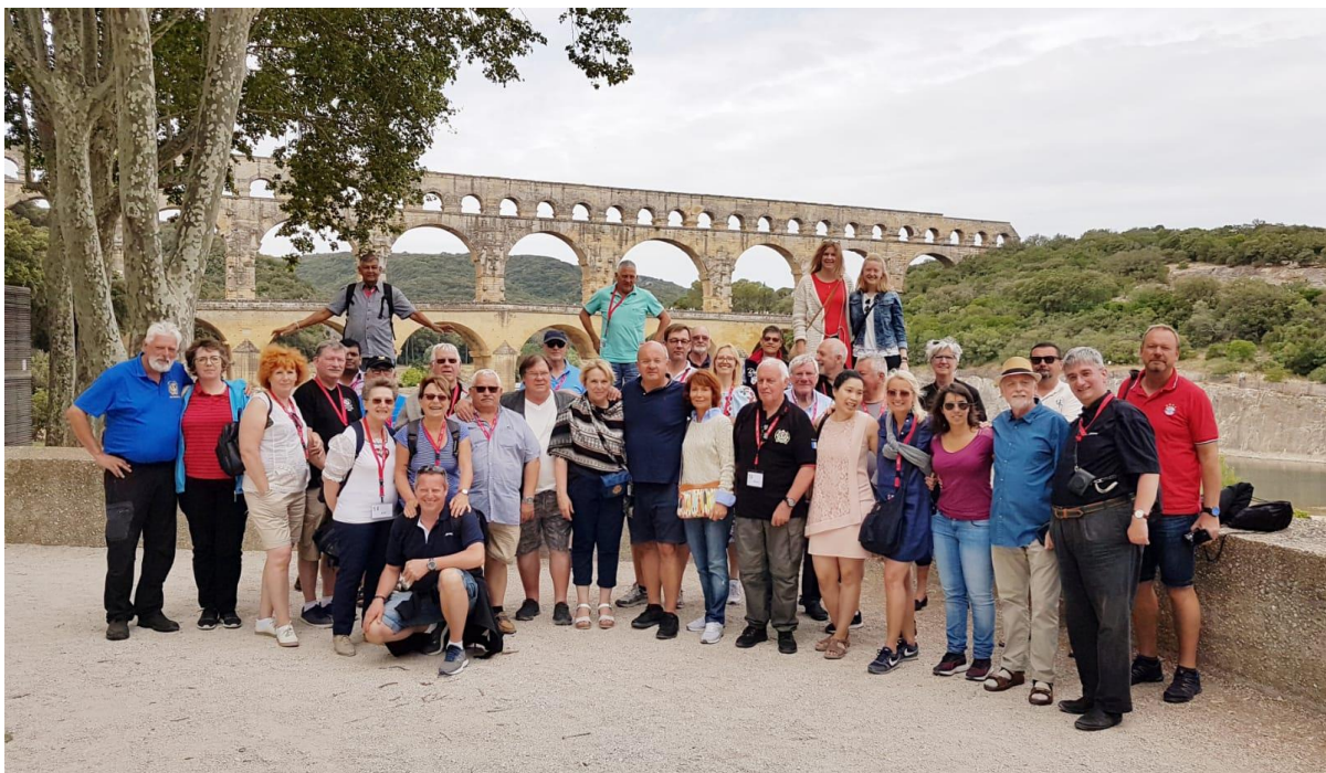
Group photo at the Pont du Gard