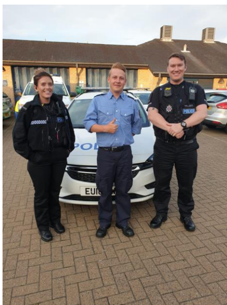
With colleagues in Colchester

For the rest of the week the pair volunteered to work full night shifts to ensure they had 'full action packed' duties – which of course they did! Needless to say that the shift they worked with, depleted of staff like all others in this day and age, were grateful for two additional officers 'for free'!